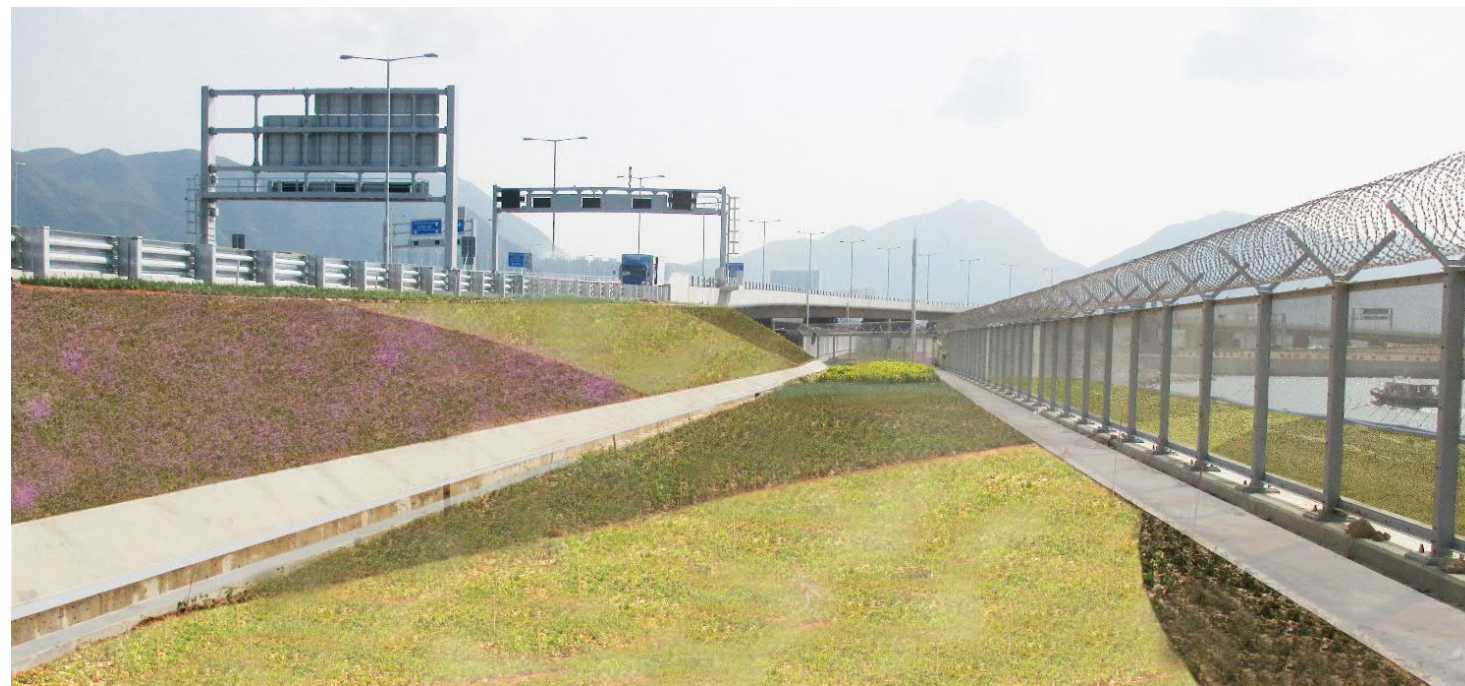
Planting along embankments of elevated roads