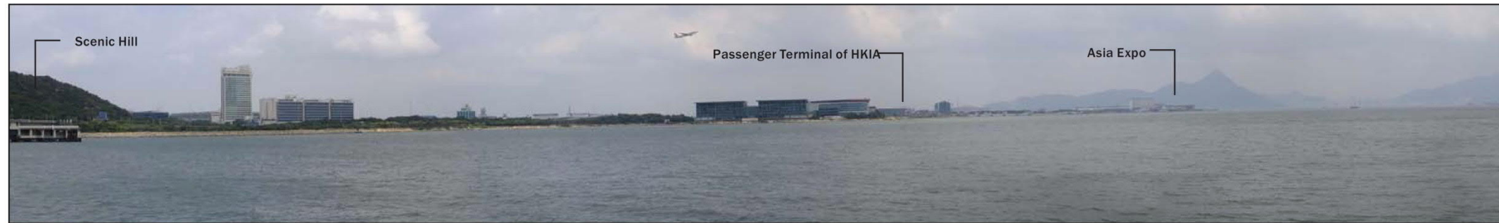
Existing Baseline Condition - Viewing Towards HKBCF (Day 1 of Construction Phase)