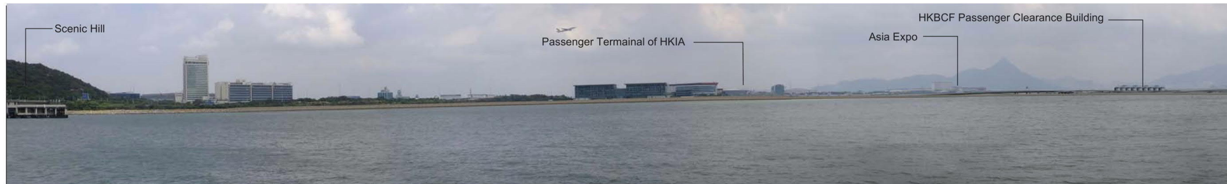
Development with Mitigation (Day 1 of Operational Phase)