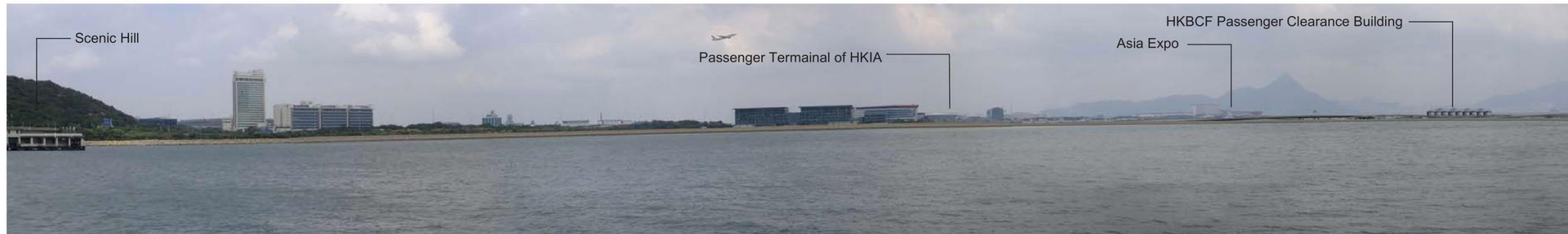
Development without Mitigation (Day 1 of Operational Phase)