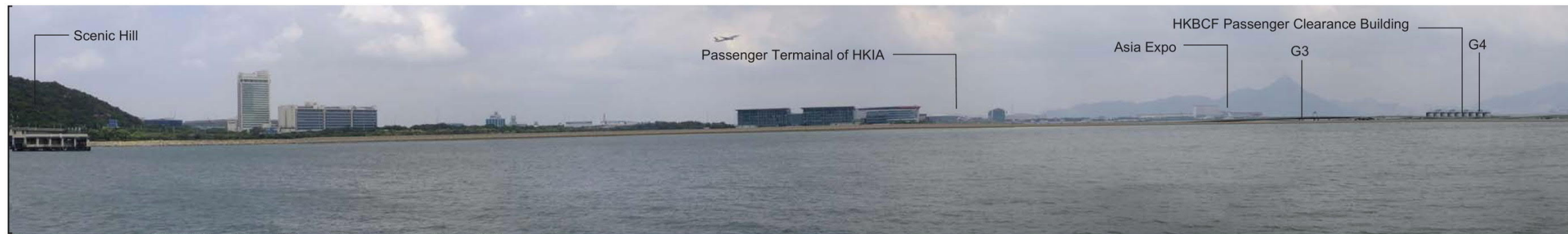
Development with Mitigation (Year 10 of Operational Phase)

Note: Reference to Landscape and Visual Impact Assessment (Ref. 072-02)